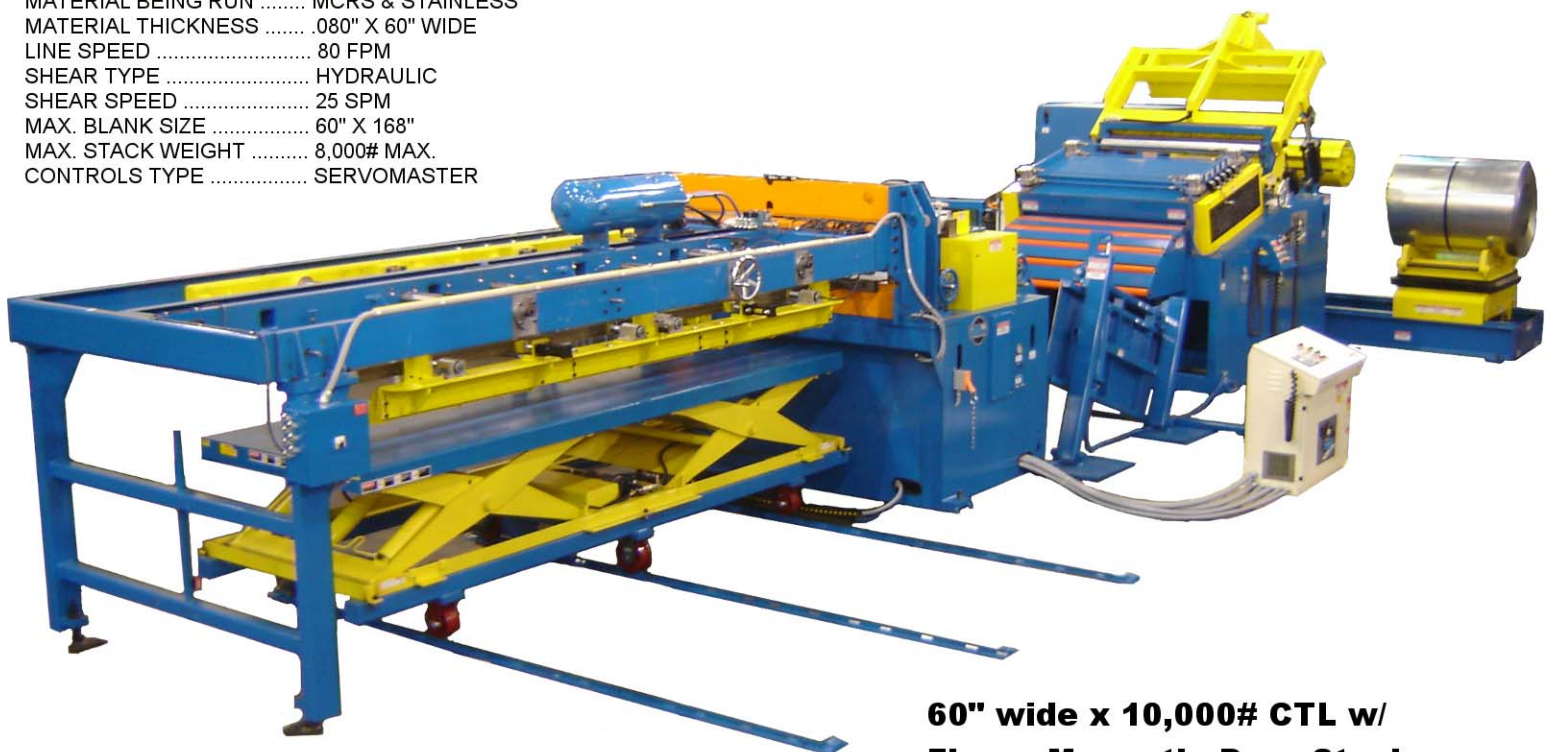
60" wide x 10,000# CTL w/ Finger-Magnetic Drop Stacker